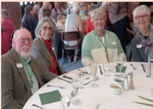
Where's that Roast!